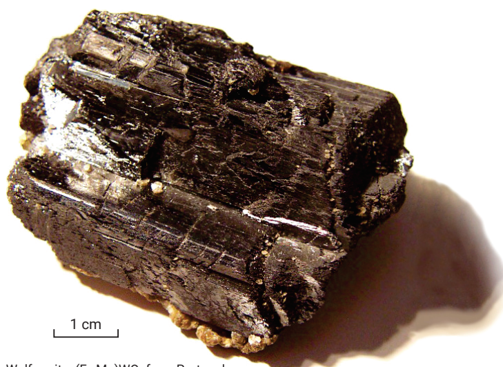
Wolframite (Fe,Mn)WO 4 from Portugal